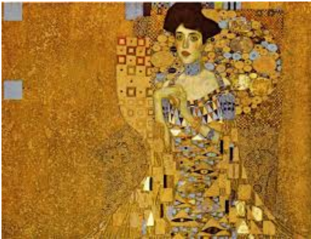
Adele Bloch- Bauer I

Klimt is most know for his “golden phase” where he applied gold leaf to his paintings.